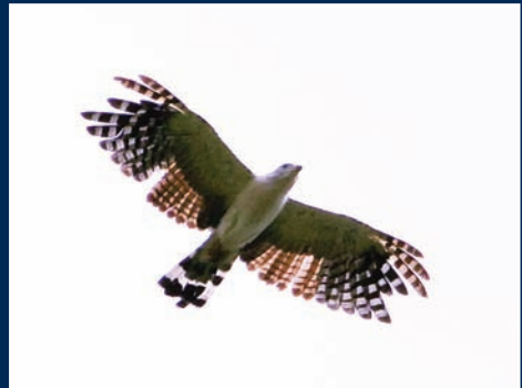
Figure 10. Juvenile White-collared Kite Leptodon forbesi moulting into adult. Alagoas, Brazil, September 2008. Inner secondaries and outer primaries retained from juvenile plumage browner. Note dark trailing edge of wings on juvenile secondaries. This bird was flying with adults (Christian Dietzen)