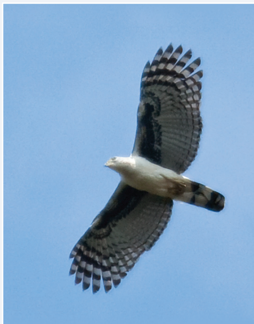
Figure 11. Grey-headed Kite Leptodon cayanensis subadult soaring. Misiones, Argentina, August 2008. Note a mix of black and white linings and yellow legs and facial skin. Although flight and tail feather look adult-like, coloration of bare parts and linings indicate this is not yet a full adult bird